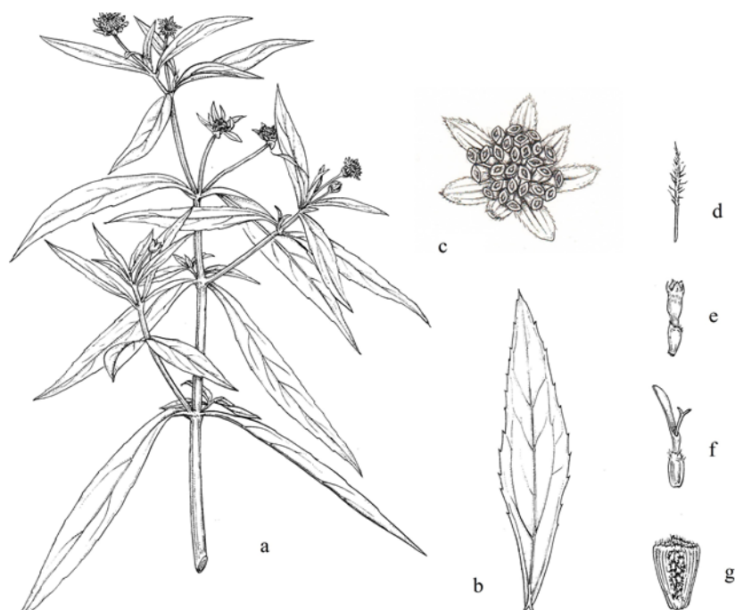
Fig. 2. Eclipta prostrata (L.) L.: a – flowering branch, b – stem leaf, c – inflorescence, d – palea, e – bisexual floret, f – ray floret, g – achene.

generally accepted method [9]. The rarity of species in the Republic of Moldova is assessed by the IUCN categories and criteria [10]. The drawings were made by Leca Petru.