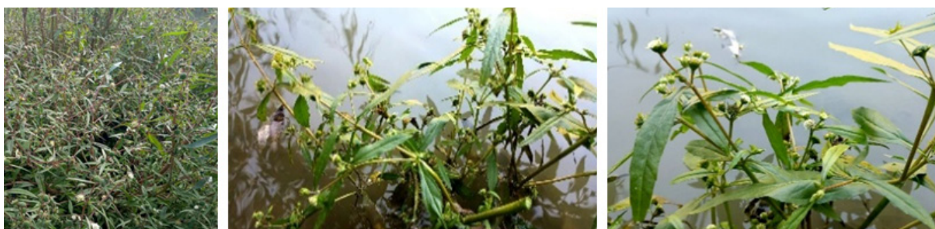
Fig. 4. Habitat (water edge) and plants of Eclipta prostrata (L.) L. from the Ramsar site „Lower Prut Lakes”.

Throughout its general range it occurs in wet meadows, in shallow waters, often a weed on roadsides. The species habit is greatly influenced by the habitats in which the plants grow. In the Republic of Moldova, it grows in the floodplain of the Prut River along damp banks as part of periodically flooded meadows and in the shallow waters of Lake Belevu, as well as canals Gârloiu and Manolescu. The habitat represents damp biotopes on the banks, among shrubs of species of the genus Salix L., forms small thickets of 2 x 2 m 2 , among meadow grassland, represented by hygrophytes and mesohygrophytes: Alisma plantago-aquatica L., Alopecurus aequalis Sobol., Bidens cernua L., Bolboschoenus maritimus (L.) Palla, Catabrosa aquatica (L.) P.Beauv, Eleocharis palustris (L.) Roem. et Schult., Glyceria arundinacea Kunth, Lythrum salicaria L., Oenanthe aquatica (L.) Poir., Persicaria amphibia (L.) Delarbre, Persicaria hydropiper (L.) Delarbre, Phalaroides arundinacea (L.) Rauschert, Phragmites australis (Cav.) Trin. ex Steud., Ranunculus sceleratus L., Rorippa amphibia (L.) Besser, Scirpus tabernaemontani C.C.Gmel., Stachys palustris L., Typha latifolia L., Veronica anagallis-aquatica L., Veronica anagalloides Guss. etc. The plant was registered in patches, in the vegetal association dominates with abundance 3-4. Solitary specimens grow scattered in water nearby (Fig. 4).