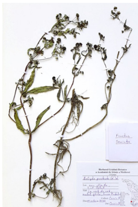
Fig. 1. Eclipta prostrata (L.) L. – herbarium sample.