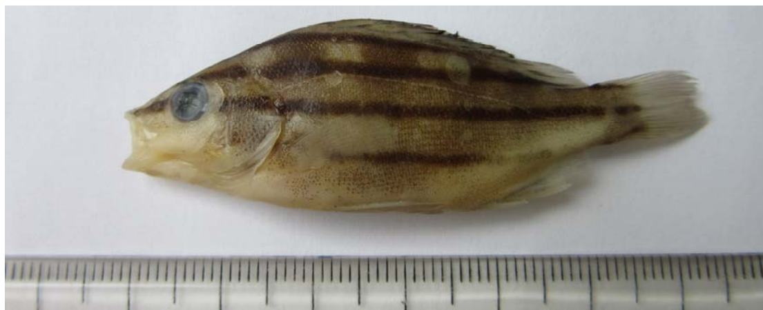
Fig.4. Rhyncopelates oxyrhynchus (Temminck and Schlegel, 1842).

Standard length = 0.83 (0.81 - 0.89) Total length = 0.84 (0.83 - 0.85) Fork length = 2.83 (2.79 - 2.86) Head length = 6.43 (6.28 - 6.60) Postorbital = 2.48 (2.39 - 2.53) Predorsal 1 length = 1.36 (1.31 - 1.39) Predorsal 2 length = 1.45 (1.41 - 1.51) Preanal length = 1.58 (1.53 - 1.64) Pre-anus length = 2.85 (2.74 - 2.98) Pre-pelvic length = 2.57 (2.76 - 2.95) Length of base dorsal 1 fin = 7.50 (6.20 - 9.10) Length of base dorsal 2 fin = 5.16 (4.95 - 5.48) Length of base anal fin = 10.11 (9.86 - 10.58) Eye diameter = 14.17 (13.54 - 15.00) Interorbital width = 8.01 (7.66 - 8.53) Snout length = 6.50 (6.11 - 7.00) Length of caudal peduncle = 8.35 (8.16 - 8.68) Depth of caudal peduncle = 2.78 (2.66 - 2.92) Depth of body = 5.12 (5.01 - 5.22) Length of dorsal 1 = 6.31 (5.89 - 6.78) Length of dorsal 2 = 5.41 (4.99 - 5.73) Length of anal = 5.07 (4.95 - 5.17) Length of pectoral = 4.12 (4.08 - 4.20) Length of pelvic = 4.39 (4.28 - 4.55) Length of upper caudal lobe = 4.60 (4.18 - 4.89) Length of lower caudal lobe = 5.18 (4.93 - 5.54) Length of median caudal rays.