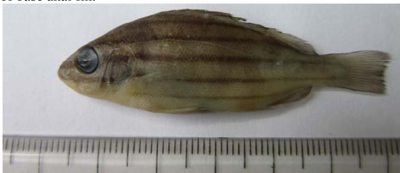
Fig.2. Pelates quadrilineatus (Bloch, 1790).

Length of caudal peduncle = 1.60 (1.53 - 1.70) Depth of caudal peduncle ; Eye diameter = 1.23 (1.08 - 1.36) Interorbital width ; Length of base dorsal 1 fin = 1.82 (1.56 - 2.36) Length of base dorsal 2 fin = 1.52 (1.41 - 1.61) Length of base anal fin .