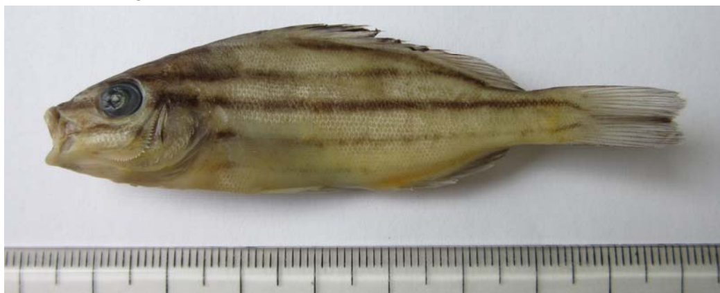
Fig.3. Helotes sexlineatus (Quoy & Gaimard, 1825).

Material examined. (14 specimens) GRT 015 to GRT - 027, Gianh estuary and Gianh downstream, Quang Binh province, 10 - 15 August 2008, 20 - 27 December 2009 and 6 October 2010.