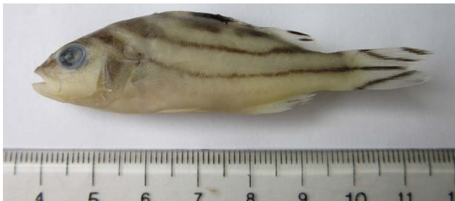
Fig.5. Terapon jarbua (Forsskål, 1775).