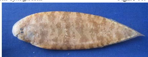
Figure 12. Cynoglossus puncticeps