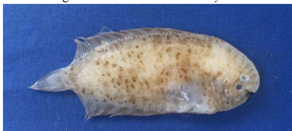
Figure 6. Achiroides melanorhynchus