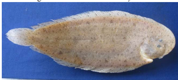
Figure 8. Heteromycteris japonicus