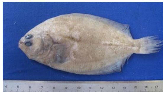
Figure 3. Pseudorhombus cinnamoneus