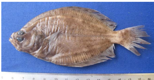
Figure 2. Paralichthys olivaceus